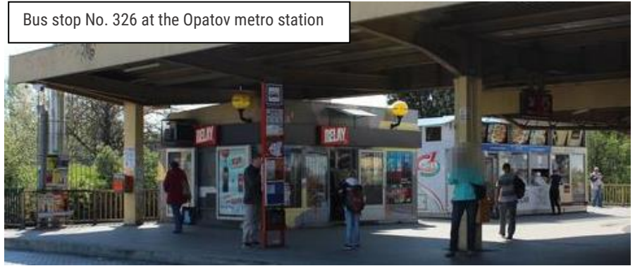
Bus stop No. 326 at the Opatov metro station

3) Follow the sidewalk to the right and enter the BIOCEV campus gate